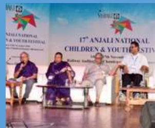
DIALOGUES IN DISABILITY