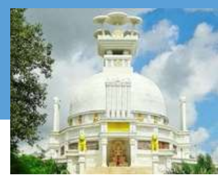
CITY TOURS Exploring Bhubaneswar