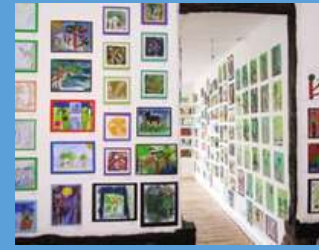
EXHIBITIONS Art-Photo-Cartoons- Hobby