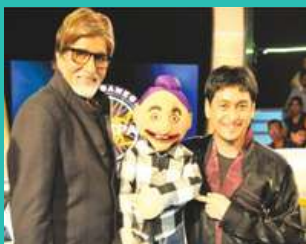
SPECIAL SHOWS Puppetry, 3D Art and Magic