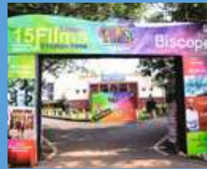
BISCOPE Children's Film Festival