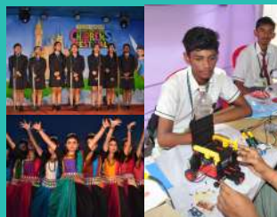
CONTESTS 12 Literary, Performing, Creative & Scientific