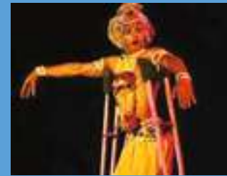
INDRADHANUSH Dance & Music Professional Artists