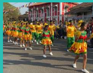
CARNIVAL OF LOVE Rhythm-Music & Fun