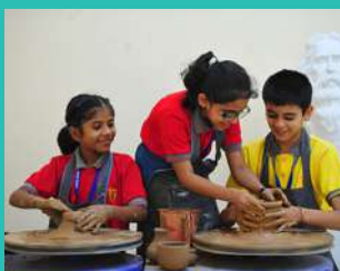
WORKSHOPS 15 Categories