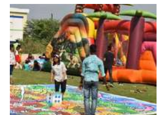
FUN UNLIMITED Games, Star Gazing & Face Painting