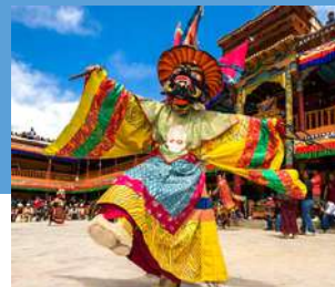
FESTIVALS OF JOY Raja and Losar