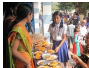
FOOD ZONE Delicious & Mouth Watering